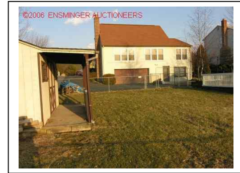
Rear view, shed #2, yard