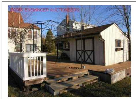
Shed # 1, Deck