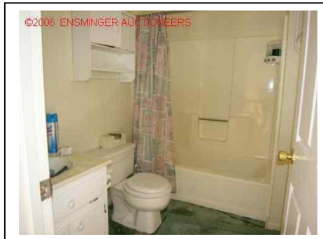
Bath – Second Floor