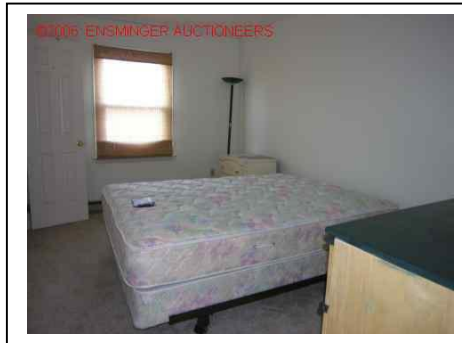
Bedroom #2 – Second Floor