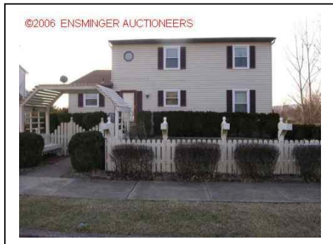
Front of House

April 1, 2006 929 Pennsylvania Ave., Harrisburg, PA 17112 REAL ESTATE at 12:00 Noon Household Items start at 9:30 AM