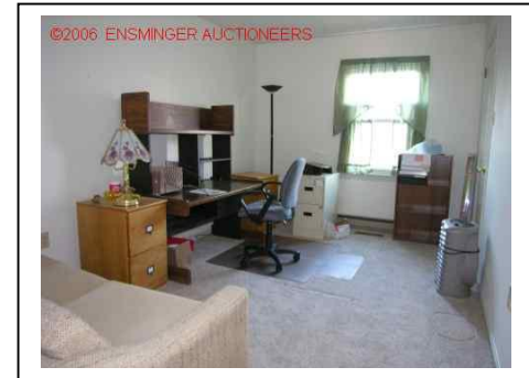
Bedroom #3 Second Floor