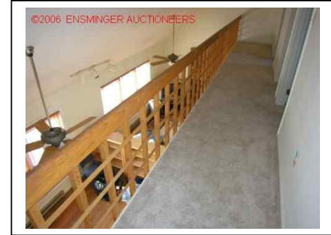
Balcony above great room