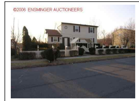
Another front view