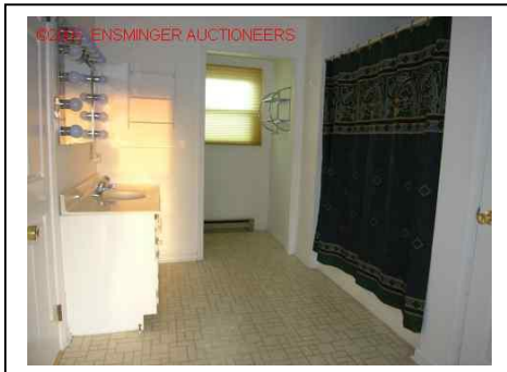
Bath – First floor