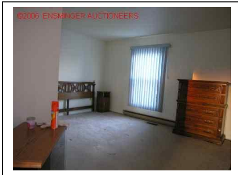
Bedroom #1 – First floor

April 1, 2006 929 Pennsylvania Ave., Harrisburg, PA 17112 REAL ESTATE at 12:00 Noon Household Items start at 9:30 AM