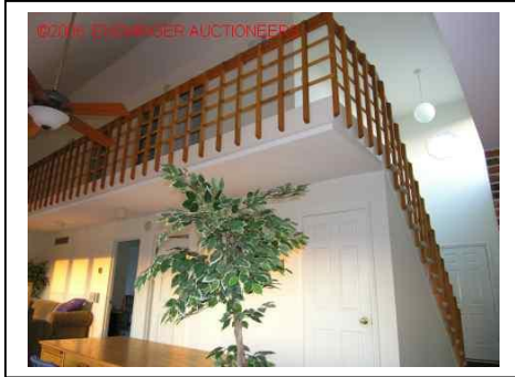
Balcony above great room